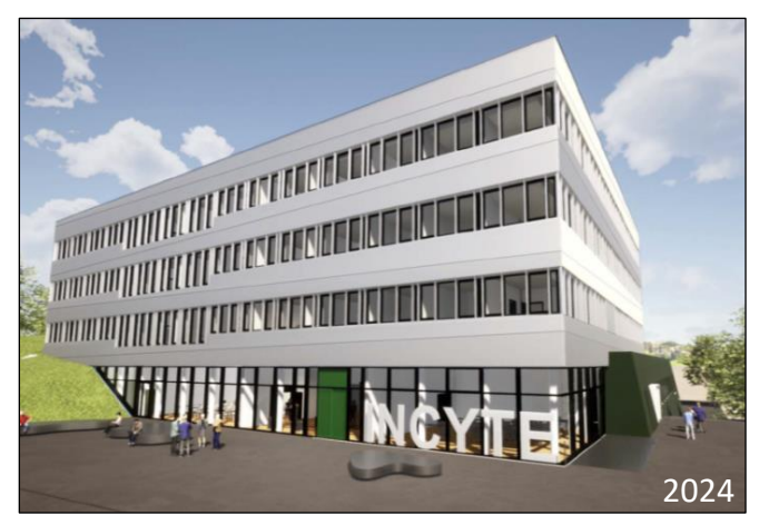
New INCYTE research building – the prospective home to the MNaF

MNaF facilitates both, fundamental materials research as well as the application-driven development of novel materials and devices.